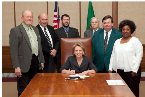
Gov. Chris Gregoire signs SB 6450. 20100312-0024 WASENATE ab